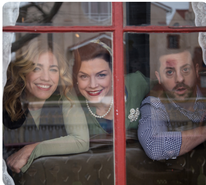
TOP LEFT: THE TWIN'S DEAD MOTHER ISN'T A FAN OF HER OWN CHILDREN, OR IS SHE?